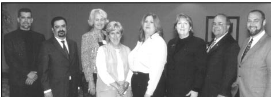
New Board members