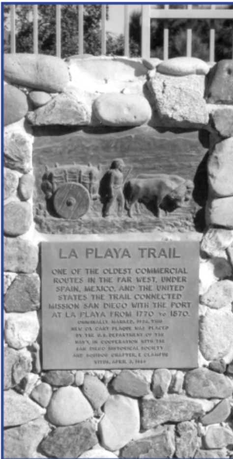
La Playa Marker

for the planting of many, many trees in Ocean Beach and Mission Beach.