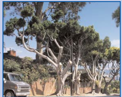
Ficus Trees on McCall

Majestic trees are among Point Loma's most valuable resources. Recent events have underscored the need to raise awareness, not just about their vulnerability, but also about their value as "green infrastructure." As many of you know, a beloved and much photographed palm tree was lost due to new construction recently on Lucinda Street. Countless postcards of San Diego Bay feature the palm from high on the hill in La Playa.