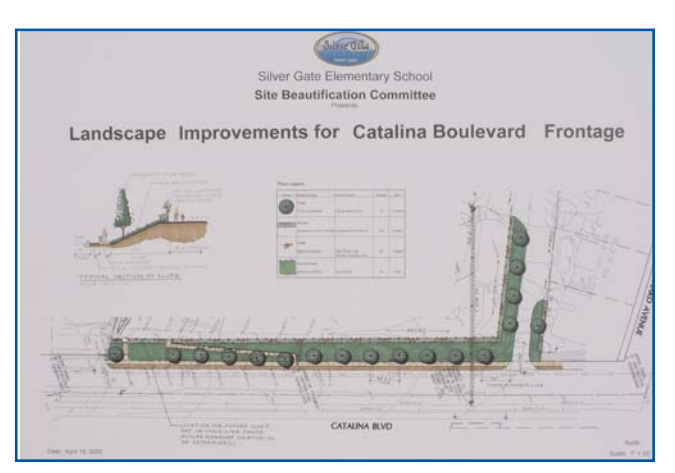
Plans for landscape improvements