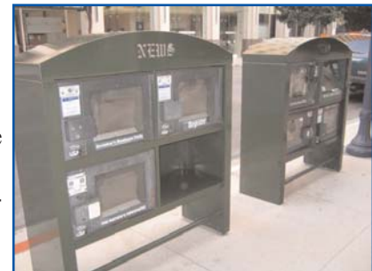
The Beautification Committee is considering the use of Newsrack Corrals as one of the possible solutions for curing the blight in front of our Village Post Office.

portions. The Point Loma representatives on this committee are anxiously waiting to take action. They will focus first on the site of our Village Post Office, starting with the removal of at least ten newsracks that will not meet the new code stipulations. We hope this will be followed by the installation of newspaper corrals, benches, bike racks, trash receptacles and plant containers.