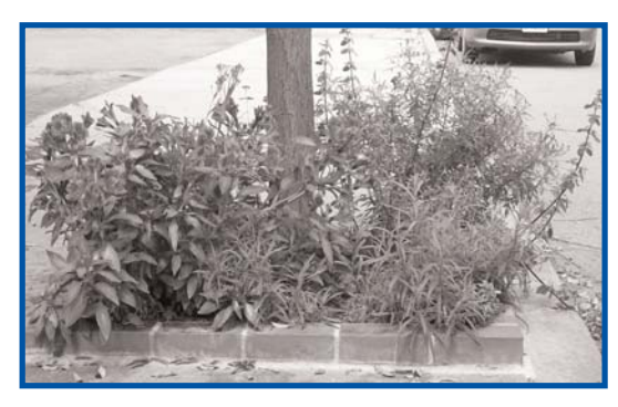
This box is located in front of Point Loma Village Florist.

The PLA Beautification Committee is underwriting the costs to water and fertilize the basins on a routine basis. If you're interested in funding the construction and planting of a basin in the Village, please contact Karen Davis at 222-3055.