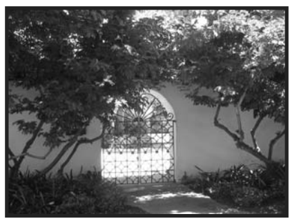
Spanish wrought iron on Curtis Street