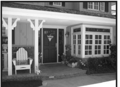
Adirondack Americana on Liggett Drive