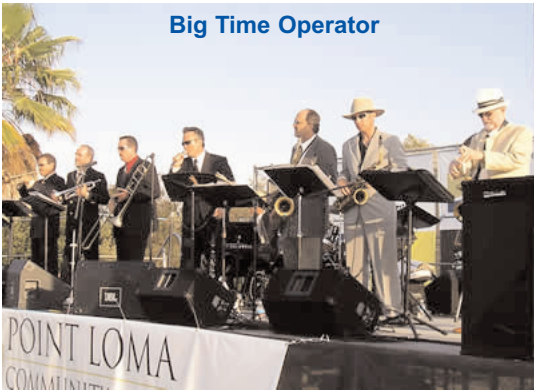
Big Time Operator