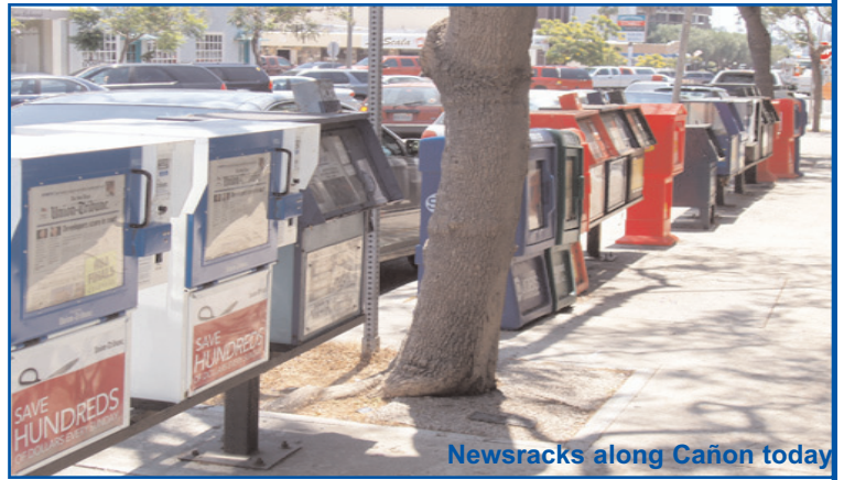
Newsracks along Cañon today

Most cities would never allow for this proliferation to occur. Now, we will have a $10 permit fee for every newsrack, plus many other controlling provisions regarding abandoned and broken down news containers. Soon, you might be able to actually get out of your car on Cañon Street.