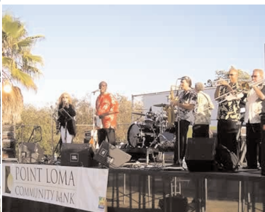
Dr. Feelgood and the Interns of Love - and the crowd loving the band