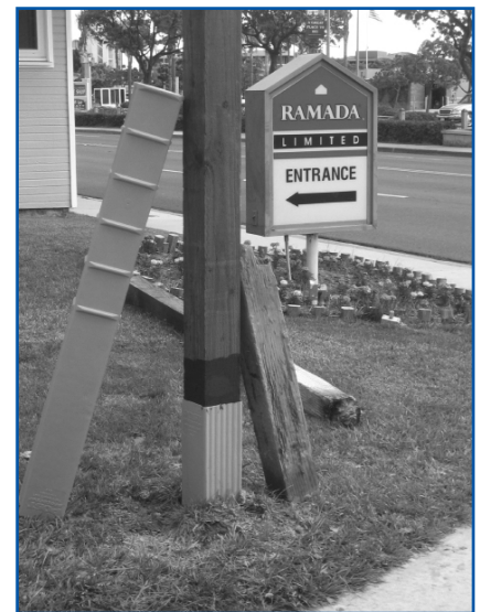
A new sign with the plastic protector showing at the bottom. Leaning on the sign is one of the five-foot plastic protectors that will be used for another sign. That's a pretty deep hole!