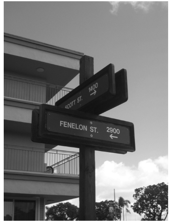
A new sign at the corner of Scott and Fenelon

Approximately four poles will be replaced per month. The cost is approximately $200 per pole. This is an unplanned cost and donations are being sought to fund the project.