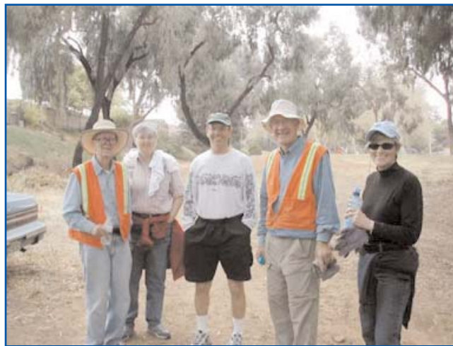
Some of the good folks who volunteered for the Cañon Street Cleanup on May 8.