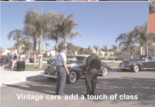
Vintage cars add a touch of class