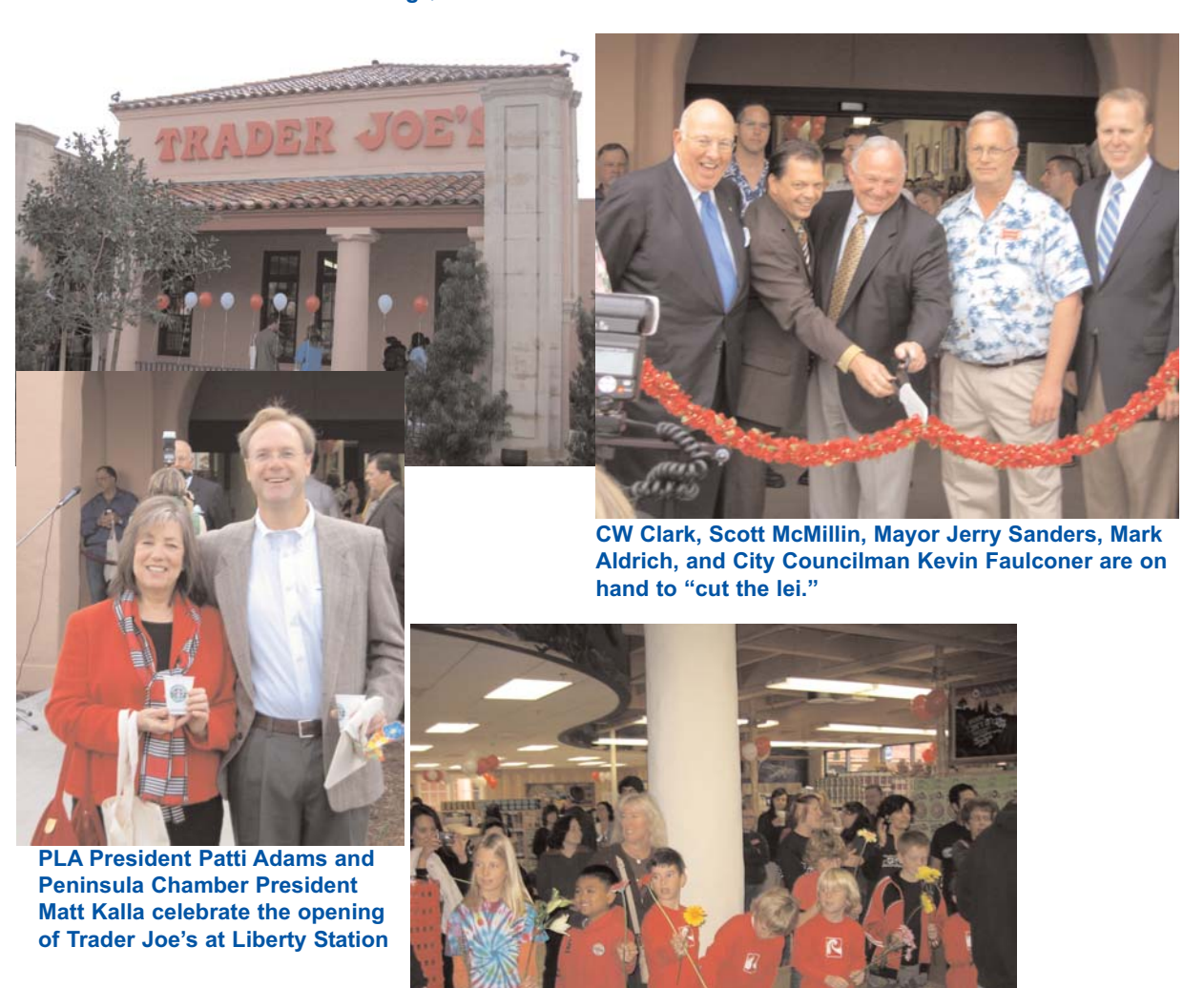
Flowers for the first customers!