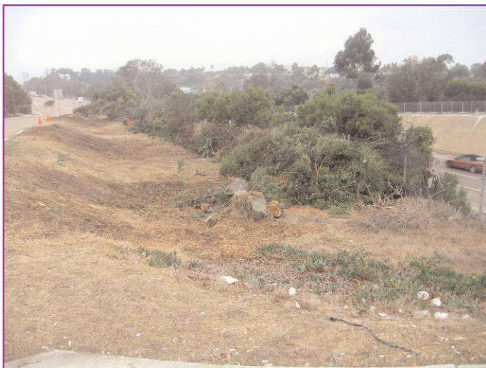
Top: Before vegetation was cleared; Bottom: After almost all the vegetation was cleared

Barnes Tennis Center: The irrigation system has been repaired and now includes a bubbler at each palm tree. Three young palm trees provided by Urban Forester Drew Potocki have been planted.