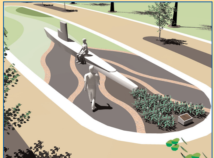
An image of the submarine on the WWII Memorial site. This does not show the water feature.