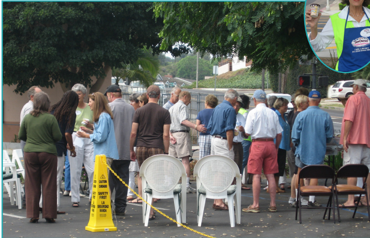
Folks being social at the Social.