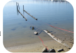
Both pictures show each storm drain as of September 16, 2009. Work had begun!