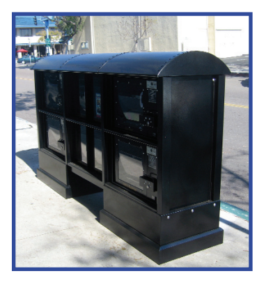
The new corral has eight slots: four free; four paid. The Union-Tribune, Wall Street Journal, Voice & Viewpoint, Navy Dispatch, Navy Compass, Distinctive Homes, and Employment Guide are currently occupying the slots. The slot reserved for USA Today is not being used, as they declined to use the corral.