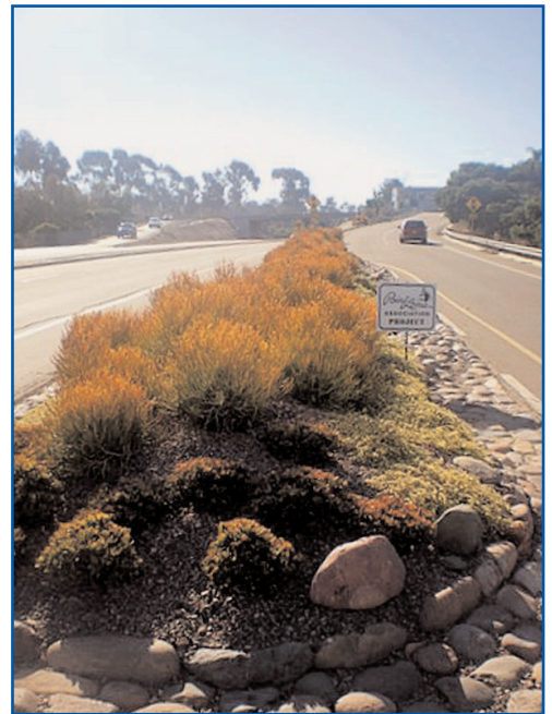
The succulent garden at the foot of the Famosa ramp