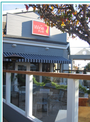
The new outdoor patio

The Wine Pub hosts Happy Hour Sunday through Thursday with a choice among two whites and two reds for $4/glass, or $4 beers. They are open until 10:00 p.m. on weekdays, and 12:00 p.m. weekends. The pub is located at 2907 Shelter Island Drive, #108. Info: 619.758.9325 www.TheWinePubSD.com