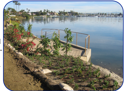
What it looks like today!

We asked for many special things during the repair: coloring the concrete so it would blend with the surrounding area; wire instead of horizontal tubes on the safety fence, vegetation to surround the concrete pad to soften the view; decomposed granite on the path and leveling the potholes and uneven parts while leaving the meandering, rolling parts of the path natural. York did it all, and did it well. The DG was blended with earth to give it all a natural look too. Professionals from the City were always helpful as if they were our neighbors. We thank them for their efforts and support before and during the repair as well.