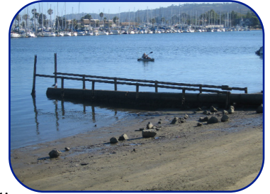
A picture from the Fall 2007 PLA newsletter.

I wanted to express appreciation for all the work that has been done here at La Playa Cove. All involved have been cooperative and helpful during the process required to repair and clean up the broken storm drain and then repair the path. York Engineering folks have been particularly responsive and cooperative good neighbors, and most who live here are appreciative of their professionalism, efforts and good will.