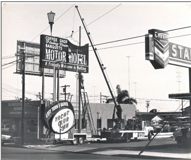
One down, ten to go...This 60-foot billboard at the corner of Talbot and Rosecrans came down in 1966.

From Rosecrans Street Revisited: "Which will it be, Point Loma ... Beauty or Billboard Beast?" So spoke San Diego Magazine in the October 1964 issue. A very timely observation, since at that time the "village" (Rosecrans Street from Cañon Street to Nimitz Boulevard) was home to 11 giant billboards and ten gas stations, arrayed with overhead power lines and poles the entire length of Rosecrans. The street lived up to its nickname 'gasoline alley.'"