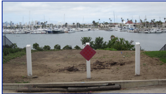
The view as of mid-June