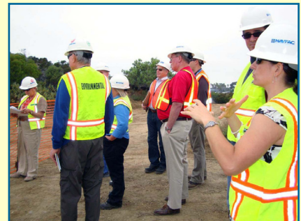
RAB members and Navy representatives touring one of the NBPL Installation Restoration sites on Point Loma during field activities