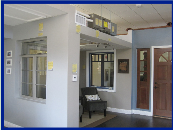
The Quieter Home Program Showroom at Liberty Station

If you're in: program consultants prepare a design package based on a home assessment, and meet with you to ensure that you're satisfied with it. Some considerations: Depending on your current existing windows, you are offered vinyl or aluminum windows (wood is only offered if you are deemed historic). Do you need an upgraded HVAC, furnace or electrical system to meet building code? (In most homes, these systems are retrofitted, along with replacement of attic insulation.) Do you have a wicket in your front door (the little hole in the door that allows you to see who rang the doorbell)? If so, it is fitted with glass. Would you like to keep the muntins in your windows? Muntins are the decorative grids in windows. This completes your terminology lesson for the day!