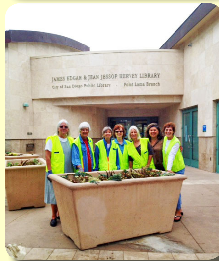
Beautification Update continued on page 4