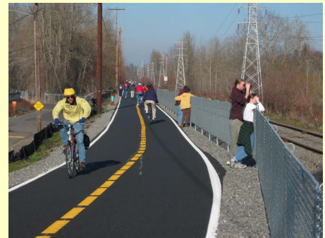
According to CalTrans, a Class I Bikeway "provides a completely separated right of way for the exclusive use of bicycles and pedestrians with crossflow by motorists minimized."

You may have seen Nicole around Point Loma. Every day, she herds a gaggle of bicyclists to school, ensuring safe passage. Her vision? Safe passage for students and residents across Point Loma. According to Nicole, there are 9,000 students in Point Loma who don't have a safe route to our schools and local parks, including schools and parks at Liberty Station.