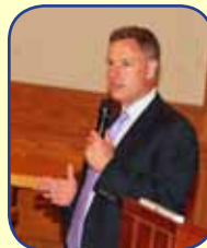
Congressman Scott Peters

Freshman Congressman Scott Peters then took the mic and listed his priorities: job creation, health care for veterans, the Shelter Our Service Members program, and the Employment Transition Act, which provides retiring veterans certifications for skills learned in the military. He urged audience members to "be in touch to get Congress working again."