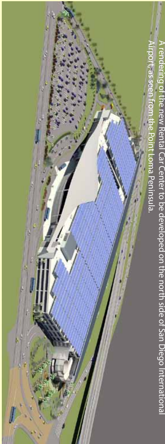
A rendering of the new Rental Car Center to be developed on the north side of San Diego International Airport, as seen from the Point Loma Peninsula.

The other piece: for 15 years, the bay front from Harbor Island Drive heading south for blocks along Harbor Drive has been filled with asphalt, rental cars, filling stations, garages and shuttle buses that have blocked views of downtown and San Diego Bay. This property is owned by the Port of San Diego, who will soon be working with the California Coastal Commission, State Tidelands Trust, an interested public, and other entities to improve the property, which will be available late 2015/early 2016. Stay tuned and stay informed!