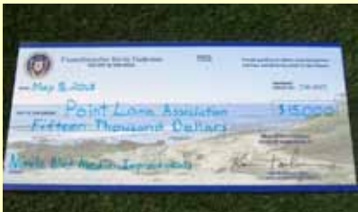
The check from Councilman Faulconer's office

The revised plan will cost significantly less, allowing the PLA to improve a longer stretch of Nimitz.