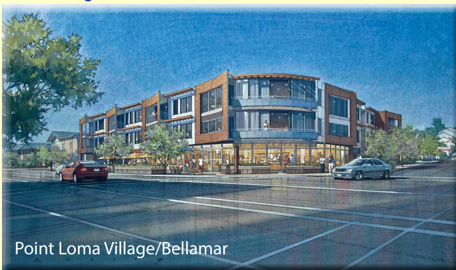
Point Loma Village/Bellamar