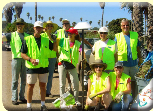
The Mean Green Team with an interesting find among the bushes.