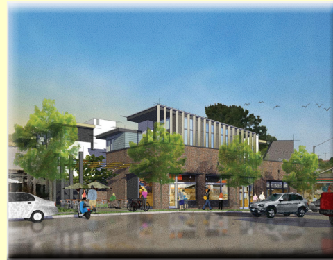
View on Voltaire (To the Point is on the left)

The project, due for completion in fall, 2014, will have 2128 square feet of retail space on the bottom floor, and eight townhomes and one flat (one-story condo) on the second and third levels. According to Russ Murfey, "The commercial component