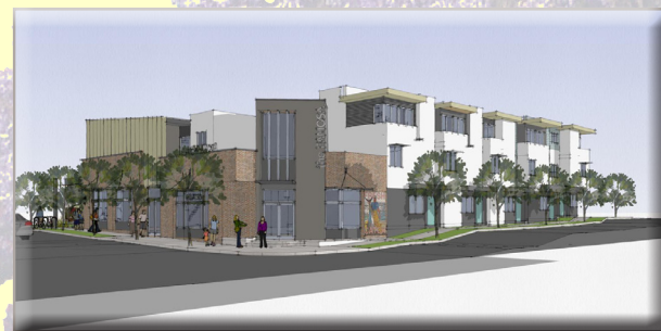
The corner of Catalina and Voltaire

For more information, go to: famosatownhomes.com .