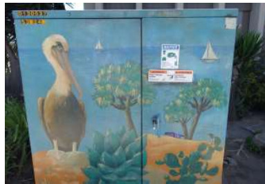
Our beautiful utility box across from Ralphs is restored after graffiti vandalism.