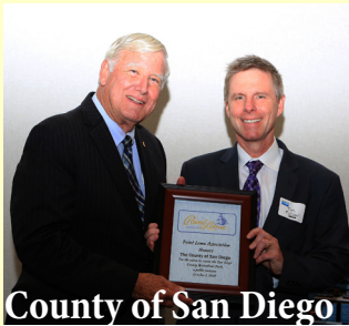
County of San Diego