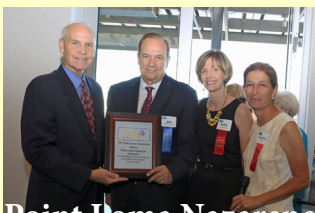
Point Loma Nazarene University